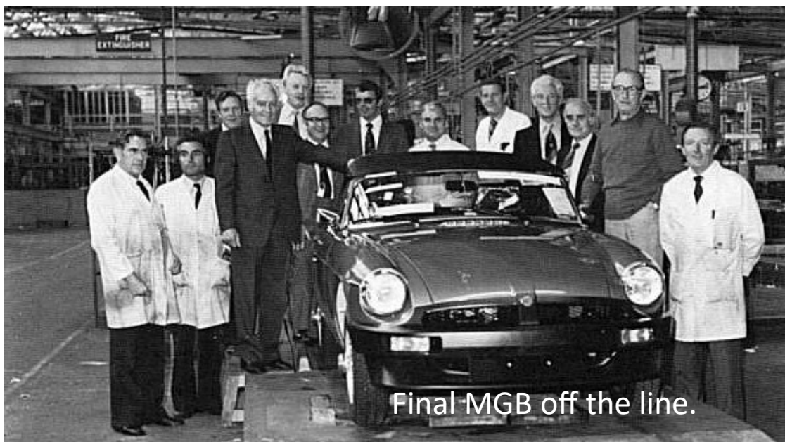
Final MGB off the line.

Around 1972 the name M.G. Car Company ceased while the MG marque continued to be used. The last MGB convertible shown below, rolled off the production line at the Abingdon factory on the 22nd of October 1980 and it ended an era of sports car motoring, not only of the MGB but also of MG sports cars in general.