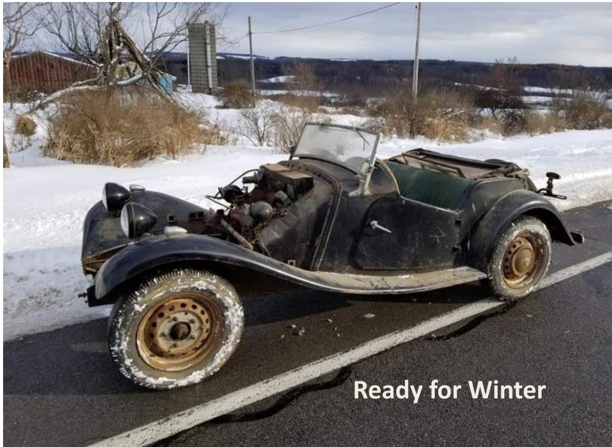
Ready for Winter