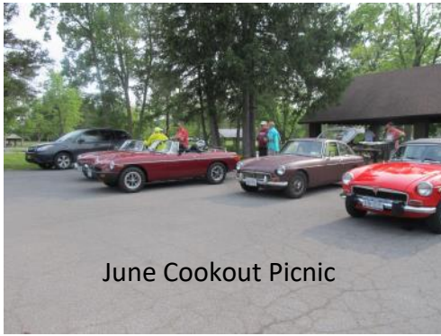
June Cookout Picnic