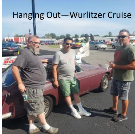
Hanging Out—Wurlitzer Cruise