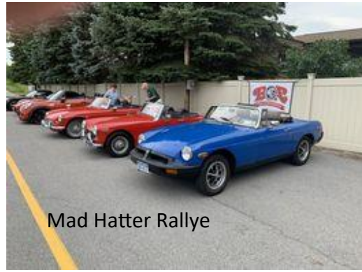
Mad Hatter Rallye