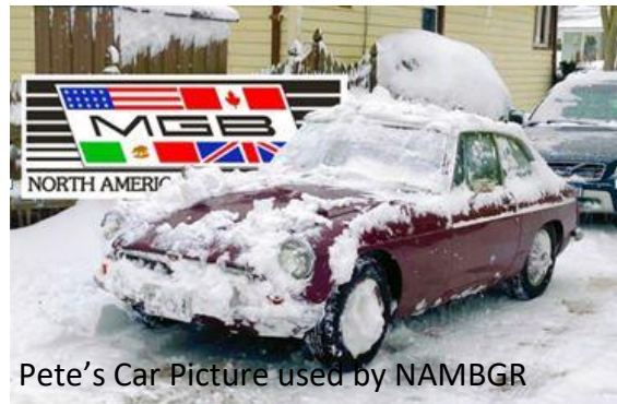
Pete's Car Picture used by NAMBGR